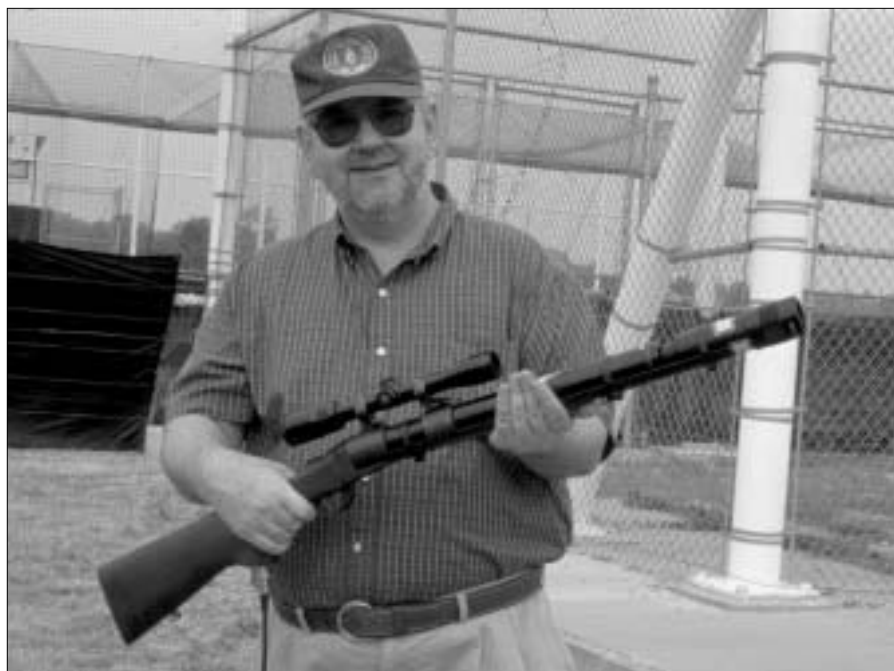
Figure 3. Lasers effectively disperse some types of fish-eating birds from their roosts at night.

Many of the tools for dispersing birds from aquaculture facilities are used in harassment patrols. During these patrols, bird chasers drive along the pond levees using a route that enables them to observe all of the open-water areas of the facility. When they see birds, the chasers use one or a combination of techniques to scare them from the