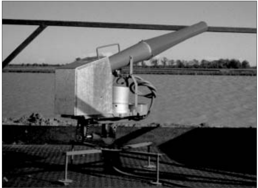
Figure 1. Propane exploders are more effective if they are moved often and if the timing of explosions varies.

All pyrotechnics can cause fires if not used carefully. In some states and localities there may be special