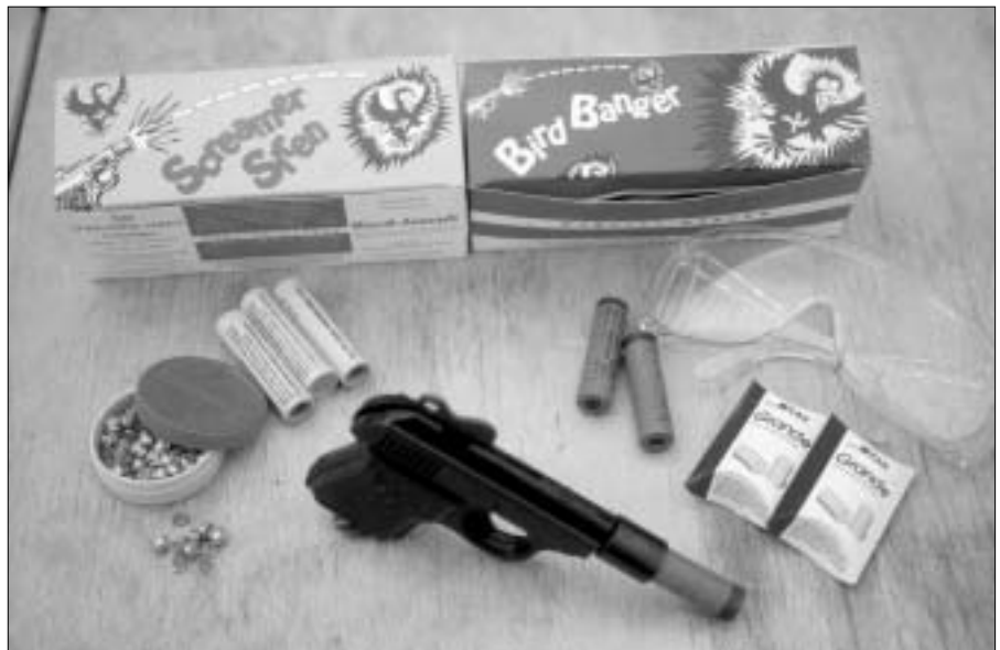
Figure 2. Pyrotechnics are an important nonlethal component of bird hazing programs.

regulations for their use, transport and storage.